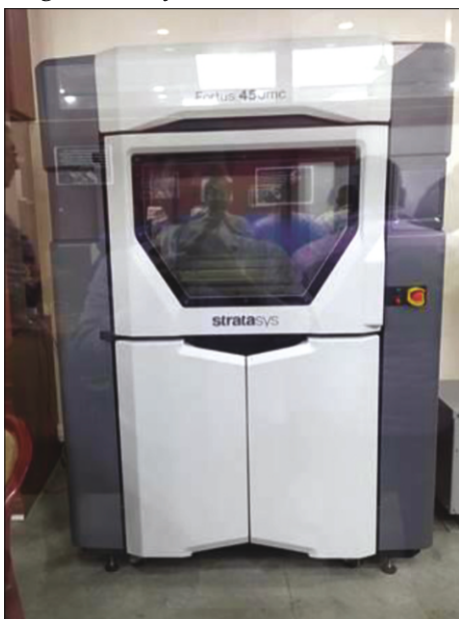
Strasys FDM 3D Printer