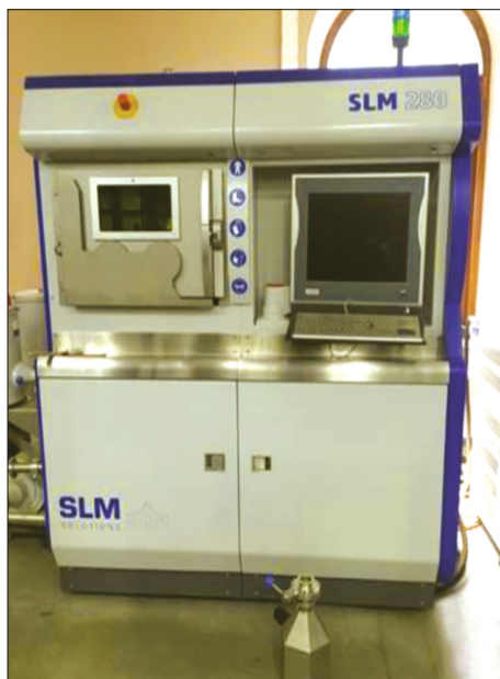
SLM Metal 3D Printer